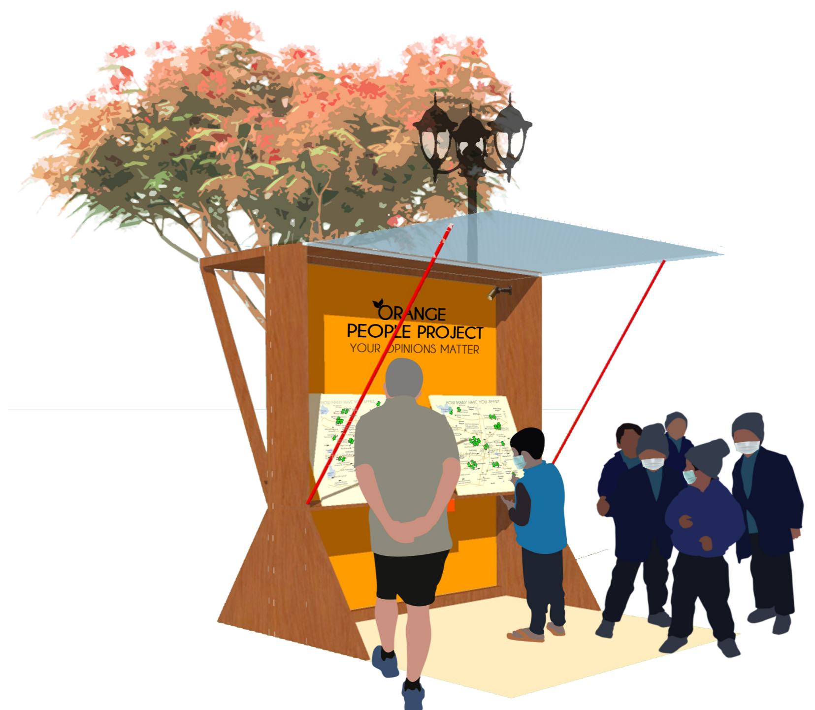
Illustration showing Kids and Elderly interacting with the booth setup in park environment

No city is complete when one cannot transit effectively. Road conditions are a constant problem in this city. With rapid urbanisation and recent metro works, the city's once wide and good roads are now a cause of concern for the people with all the potholes and missing crosswalks and confusing diversions. Often shown in newspapers like 'The Hitavada', this issue is a sounding concern to the public domain.