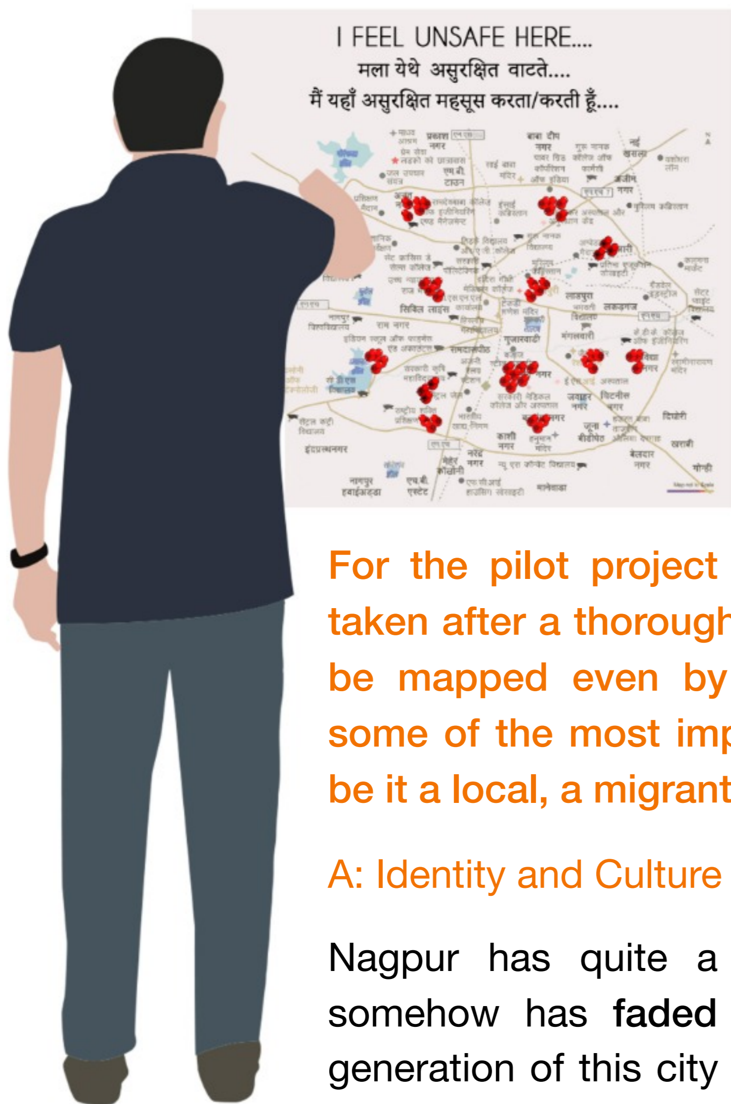
Illustration showing a person mapping on the map titled 'I feel unsafe here'

In the similar lines it is found in the Indian Ministry of Housing and Urban Affairs, which launched the 'Ease of Living' Index in January 2018 to systematically assess the cities against global and national benchmarks. And that is where we learned about the liveability index and its parameters in India. Nagpur ranks 31 st in the country as of Jan 2018.