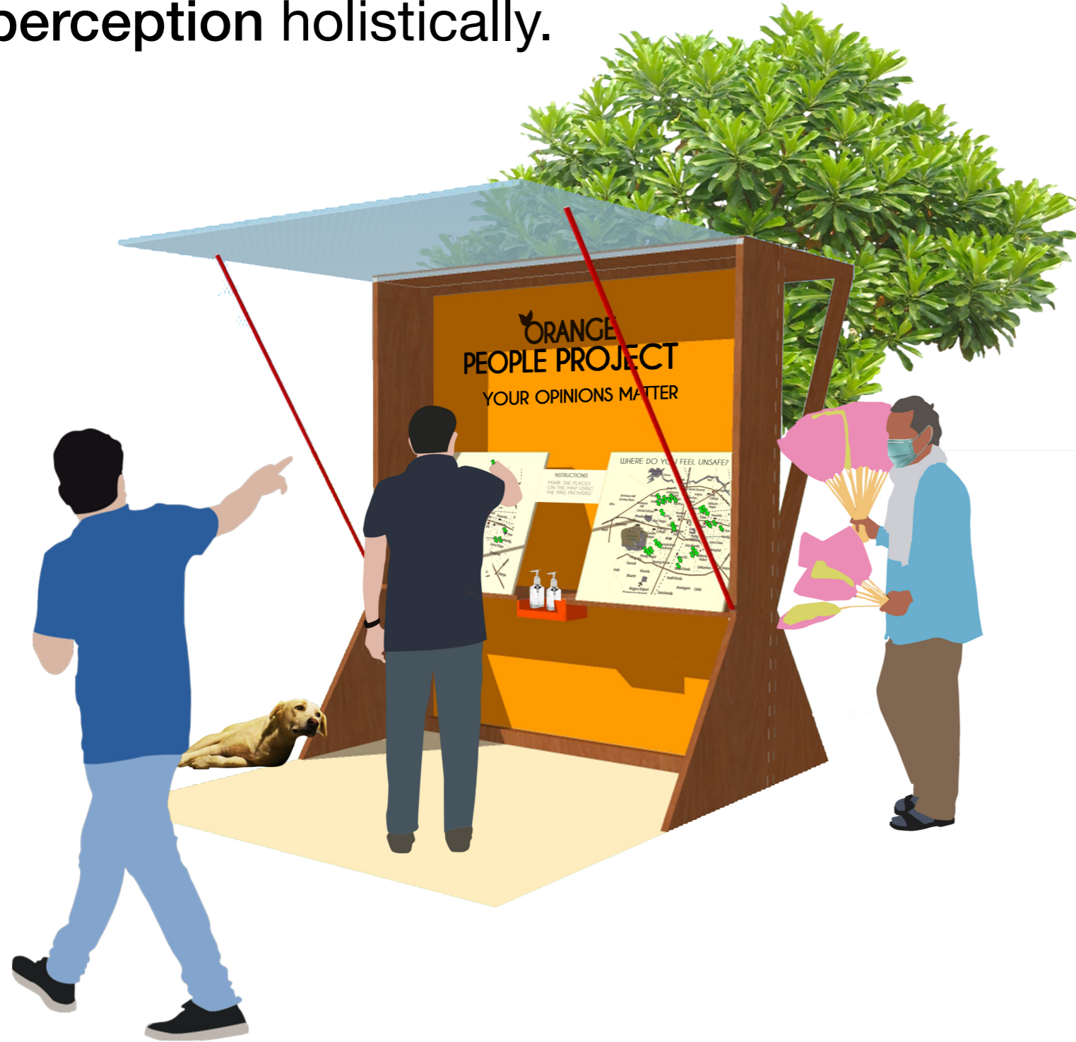
Illustration showing people interacting with the booth setup

Safety and security in a city will always be a primary concern to its citizens. Especially looking into the women and children safety, the Indian Cities have somehow failed, and hence letting people come out and talk about it can make a difference. Urban scape in India has specially failed to create places for women to loiter. It's pathetic, but talking and pointing-out about it can make a change in perception holistically.